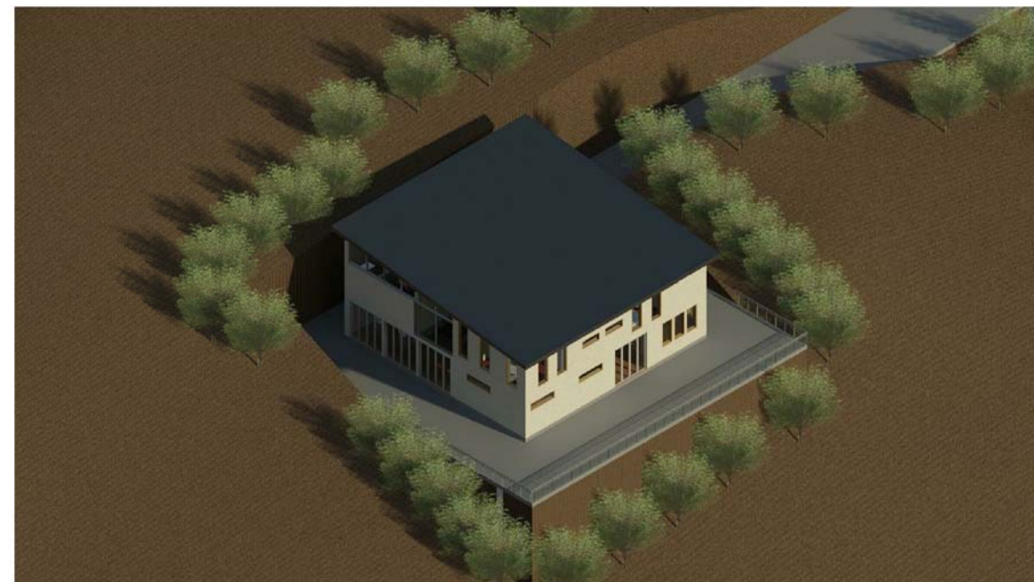
1 Site 1" = 40'-0"